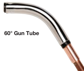
60° Gun Tube