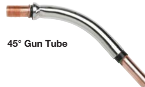
45° Gun Tube