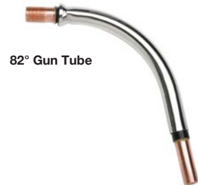
82° Gun Tube