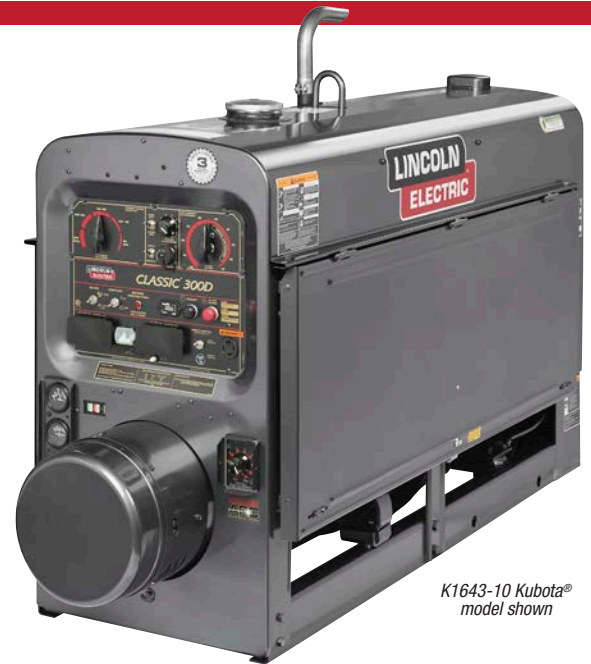
K1643-10 Kubota ® model shown