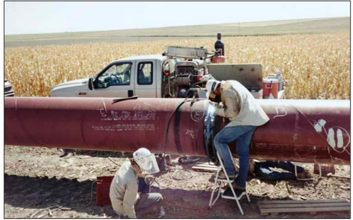
Cross-country pipe welding with Classic® 300D.