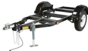
K2636-1 Medium Welder Trailer