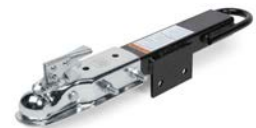
Duo-Hitch® 2 in. (51 mm) Ball/Lunette Eye Hitch (included)