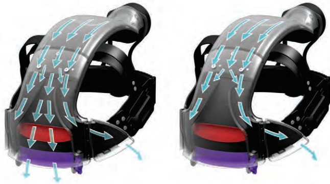
First baffle (Red) - controls ratio of air over forehead vs temples

Two air flow baffles allow users to adjust the air for maximum comfort and prevent drying of the eyes.