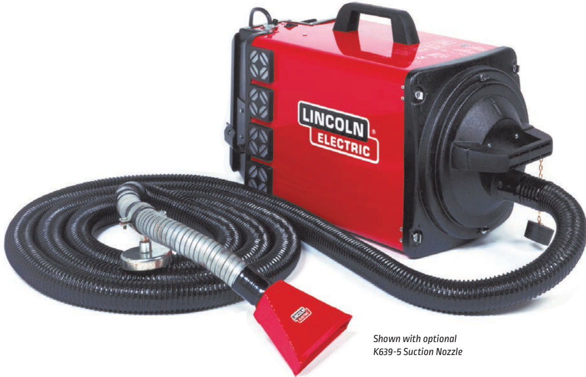
Shown with optional K639-5 Suction Nozzle