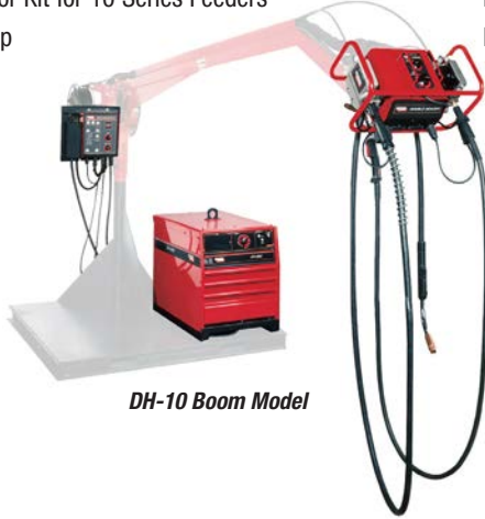
DH-10 Boom Model