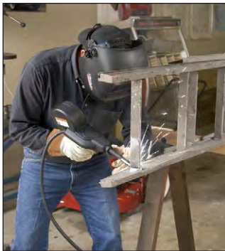
Great For Projects or Repair

Our low-priced spool gun is your most reliable aluminum feeding solution.