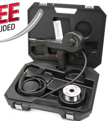
Complete Kit. No bulky module required. Order K3269-1