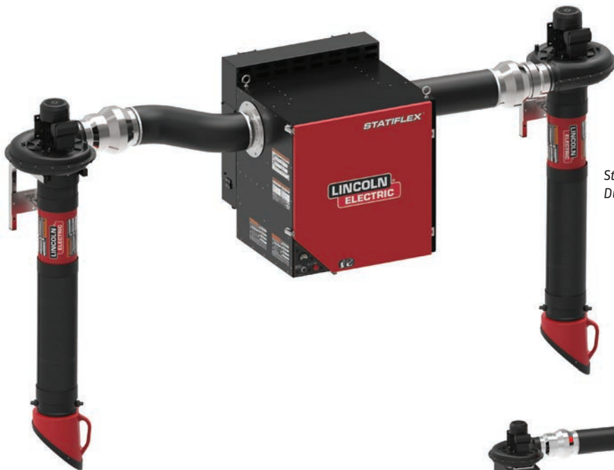
Statiflex® 800 with Dual Arm Base Unit