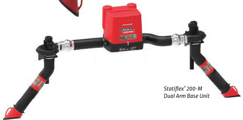
Statiflex® 200-M Dual Arm Base Unit