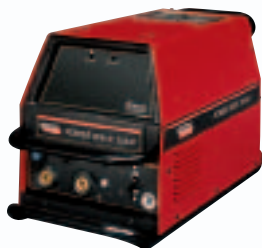
Power Wave 355M