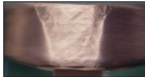
Side Bend of LNM 60/20 on Ferralium 255 base alloy