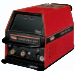
Power Wave 355M