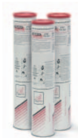
Easy Open Cans