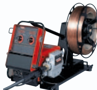
Power Feed 10M