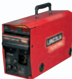
Power Feed 25M