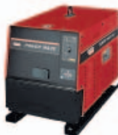
Power Wave 455M Power Wave 455M/STT