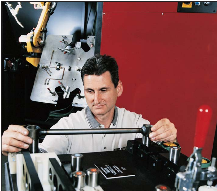
When interfaced with a positioner, complex parts are quickly welded downhand.

As was already established, it is difficult to find trained workers in today's market. What is even more challenging is in environments where code work is required, where welders have to constantly be re-qualified and keep up their skills. Some companies have gone as far as providing their own