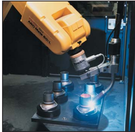
With one setup, six parts are welded

As was discussed above, some companies feel that they don't have the volume of parts to warrant investing in a robotic system. But, tooling is now commonly designed for rapid changeovers. For instance, companies are taking advantage of flexible layouts that can surround the robotic welding unit and offer room for a number of different tooling nests. The robot can be programmed to run all day in position A with a particular set of tooling nests, or it can change between positions A, B and C—doing small batches of each part. These tooling nests have also been designed for rapid changeovers so that a couple of motions will allow the operator to completely change out one tooling nest for another. And, since the