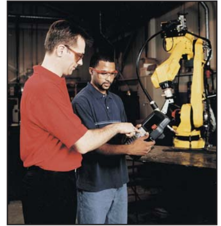
Operators learn quickly with a few hours of instruction

robot can store many different programs in its memory, the operator just has to change from one program to the other and the robot will be welding a completely different part.