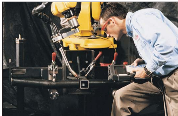
The Teach Pendant makes programming easy.

Today’s available robotic software allows companies to improve the tracking of manufacturing processes. One example is arc data monitoring software, which monitors, records and reports weld data on a “real time” basis. This can be done over the Internet (Ethernet) to a central location in the plant. A second software program is auto-error recovery that provides for a fast recovery from an unexpected robot fault should one occur on the production floor. Lastly, password protection with logging will